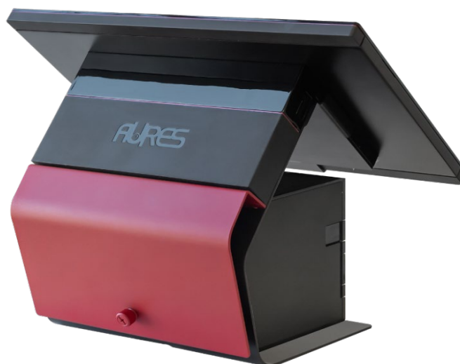
TWIST-P "all-in-one" Mini-Pack (¾ back view) with printer positioned under the screen

Terri WRIGHT AURES UK terri.wright@ares.com 01928 599 966