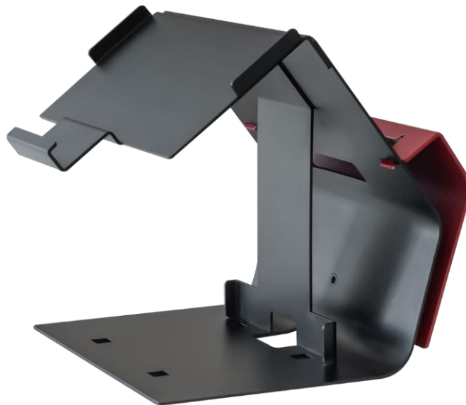
TWIST-P Stand (Support for the EPOS and its associated printer)