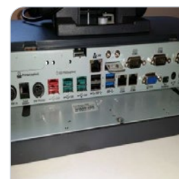
Extensive I/O ports