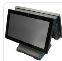
14.1 inch 16:9 LCD customer display