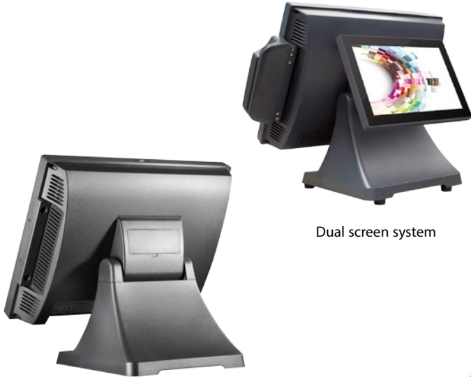
Dual screen system