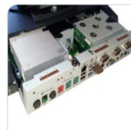
Slide in / out mother board

Specifications are subject to change without notice - © AURES 2016